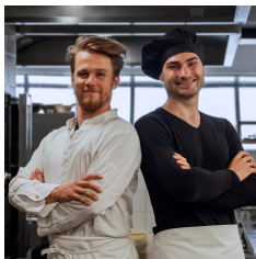
the RIGHT employees

Finding, training and ensuring the long-term engagement of the RIGHT employees with the RIGHT talents/skills for the RIGHT jobs with the RIGHT employers at the RIGHT time.