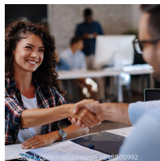
the RIGHT jobs