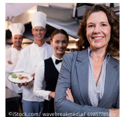
the RIGHT employers

We are looking for committed people who value sustainable working relationships in tourism. ATRACT is much more than a recruitment agency. We match you with your employer & in addition to that we offer professional & linguistic training, as well as ongoing coaching. You are supported by our ATRACT-Team in Austria, trainers & coaches.