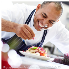
the RIGHT skills