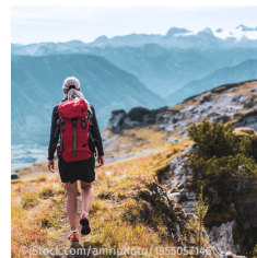
the RIGHT time